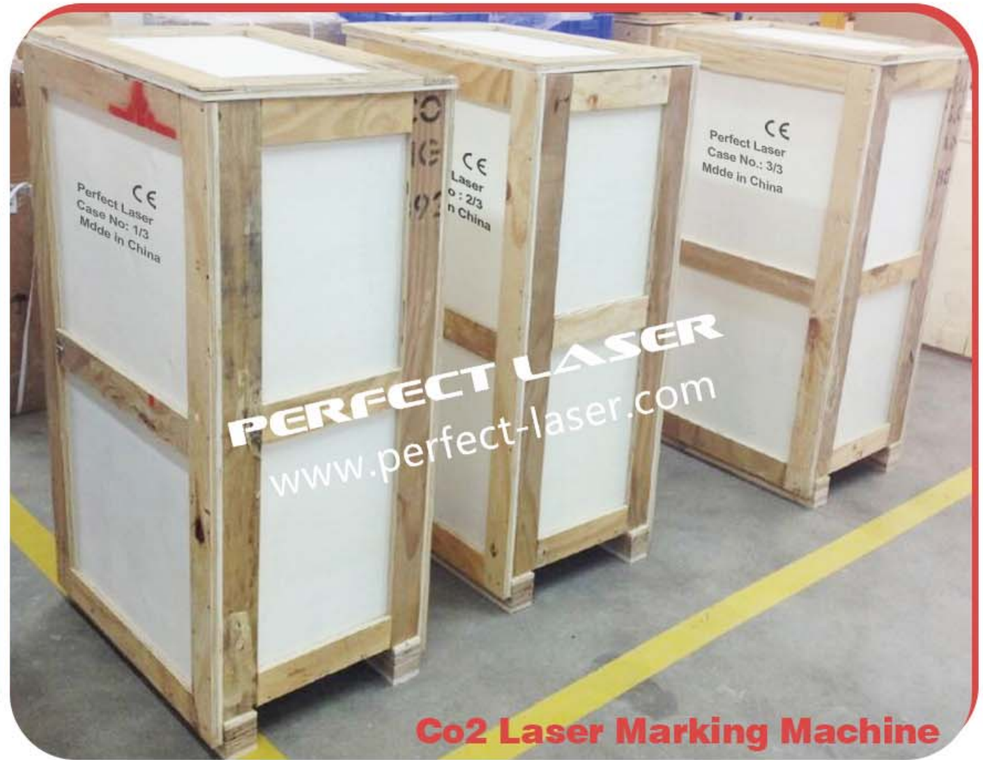
Co2 Laser Marking Machine